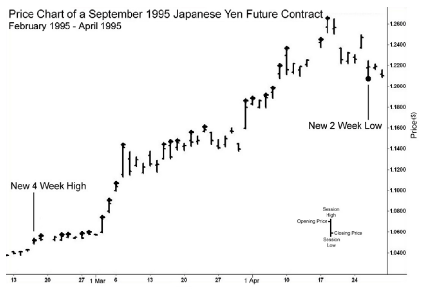
Chart 5.3: Turtle Entry Example Using Japanese Yen.

Consider this September 1995 Japanese yen chart to illustrate the System One price breakout in action: