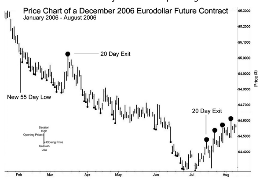
Chart 5.5: Turtle Short Entry and Exit Example Using Eurodollars.

"short" breakout occurred in February 2006 and the market continued to fall before reaching a low in June.