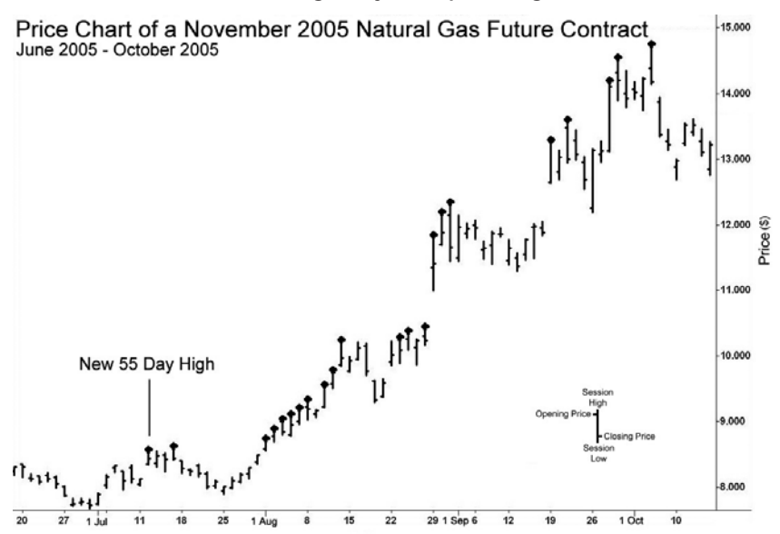
Chart 5.4: Turtle Long Entry Example Using Natural Gas.

There was no discussion about OPEC, government reports, or other fundamental factors used in Cheval's decision-making. It was all about the price action telling her to enter and exit. It is important to note that Turtles always exited after the market went against them, thus having to endure the painful experience of giving back profits. You